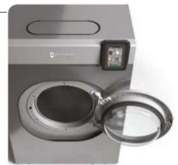
Easy to get clothes in and out with a 180° opening door