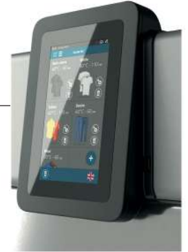
Simple to use 7in touchscreen