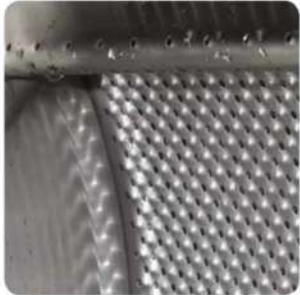
Drum designed to be gentle on fabric